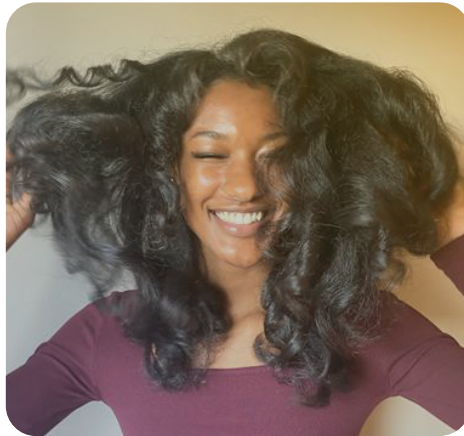
The Momentum Dryer's Results! Drying Time: 45 minutes!