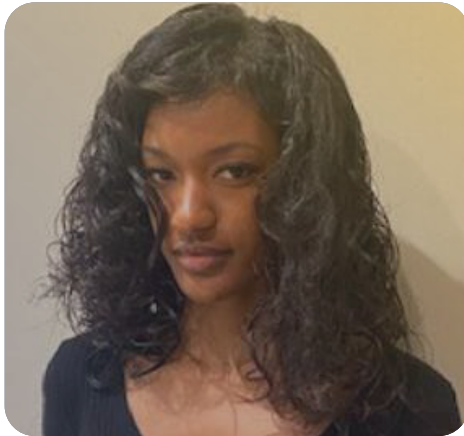
Traditional Dryer/Competitor's Results! Drying Time: 2 hours and 20 minutes